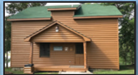
Cabin 130 Lot 29 Phase III