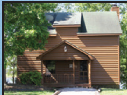
Cabin 132 Lot 31 Phase III

Large Detached Garage, water front deck • MLS#420742 $239,900