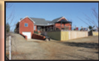
440 CR 575 - Rogersville

Business opportunity. Nice modern 3 bedroom home with greatroom and kitchen, 2 cabins on the property with yellow poplar walls, tin ceilings, barn wood cabinetry, 8 private RV sites with hook ups all on 5 acres. Currently used for short and long term rentals. Enjoy living here and managing your own business. The property is just 300 yards from Second Creek Public Boat Ramp & dock on Wheeler Lake. MLS#416565 • $457,900